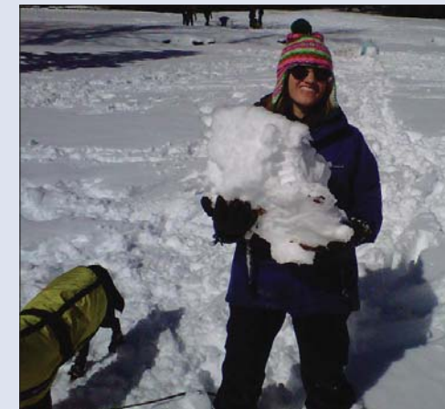
Kinda big, don't ya think?

before the trip, our students begin to prepare food for the trip, and excitement begins to build. Students often remark that this experience is one of the highlights of their time in the program. This year was no exception. Soft snow fell the whole time they were skiing, and the students, some of whom had never been to snow country before, felt that the snowfall only "made it better." The cabin was located on a golf course, and the last morning was spent building a snow man, making "angels" in the snow, and ended with a raucous snowball fight. Upon their return, virtually all of the students exclaimed, "It was awesome!"