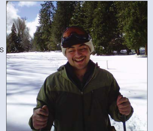
First trip to the snow

For close to 30 years, Hatlen Center students have gone on a cross country ski trip in the Sierra Nevada mountains. The 3-day field trip is accomplished in collaboration with another Bay Area nonprofit called Environmental Traveling Companions (ETC), which provides a cabin, ski equipment, and a sighted guide for each student. Several days